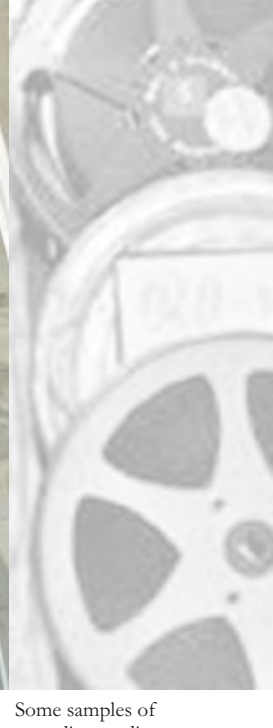
as part of the collection

The physical Collection of Authentic Bulgarian Folk Music is presently kept at the Institute for Art Studies at the Bulgarian Academy of Sciences (IAS-BAS). This collection comprises 250 000 items of various types: manuscript descriptions, notes, audio records, photographs, video records and films.